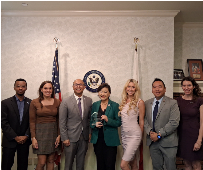
SGVRHT Staff present an award to Congresswoman Judy Chu for her support for affordable housing in the San Gabriel Valley

Participated in panel presentations at the American Planning Association and Housing and California Housing & Community Development conferences